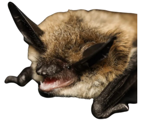
Honey Bunches is a long eared myotis bat