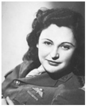
Nancy Wake, Germany's most-wanted

2. Which of the three women we discussed would you most like to have met? Why?