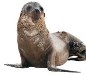
Galapagos fur seal