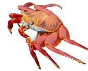
Sally lightfoot crab