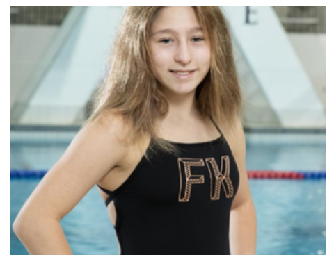
Australian Institute of Sport