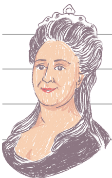
Catherine the Great: Influencer of the 1600s.