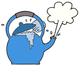
H 2 O as a gas is steam

There are three main states of matter: gases, liquids, and solids. (A fourth, plasma, is a charged gas... you'll get to that in high school chemistry!)