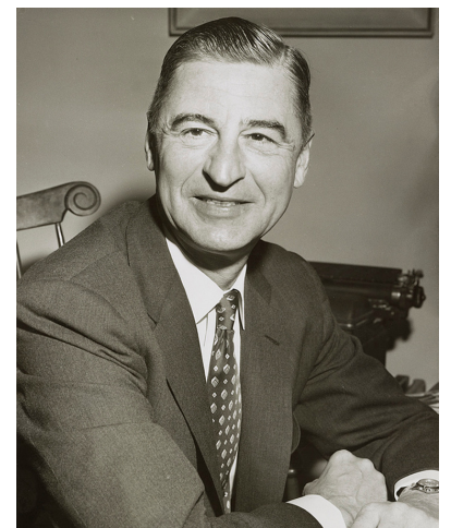
Dr. Seuss in 1957

4. Dr. Seuss was born on March 2, 1904. How old would he have been on March 2, 2022? You can easily calculate his age in years. Then, convert it to months, or—a real challenge—days!